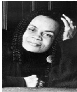
Sonya Sanchez at MAS

Poet and playwright Sonia Sanchez is the author of more than a dozen books of poetry and several plays and children books. Among her many honors, she received the Community Service Award from the National Black Caucus of State Legislators, the Pennsylvania Governor's Award for Excellence in the Humanities, and a National Endowment for the Arts Award from the Pew Fellowship in the Arts. Ms. Sanchez genius and passion as an artist come alive during a special reading of selected poems from some of her treasured books.